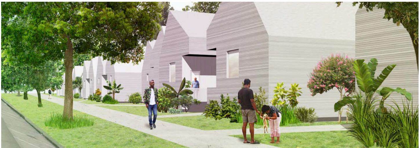
Bastion is located at 1901 Mirabeau Ave. and 10 minutes from the New Orleans VA Medical Center.