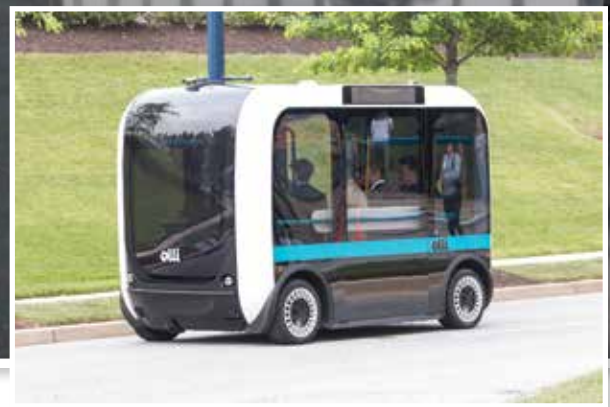
Olli by Local Motors. The world's first co-created, self-driving vehicle.

While the Ravens are away, IBTTA will play! Join your colleagues and friends at the Baltimore Ravens Stadium for some away game fun. Enjoy city and waterfront views from the Club Level or take your food and drink out in the seats for views of the field.