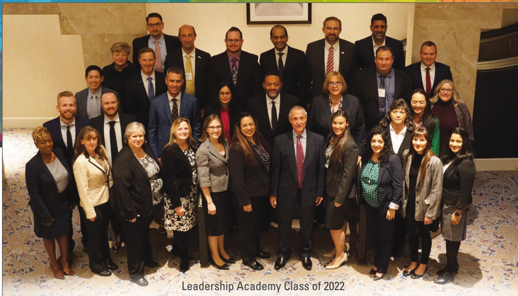
Leadership Academy Class of 2022