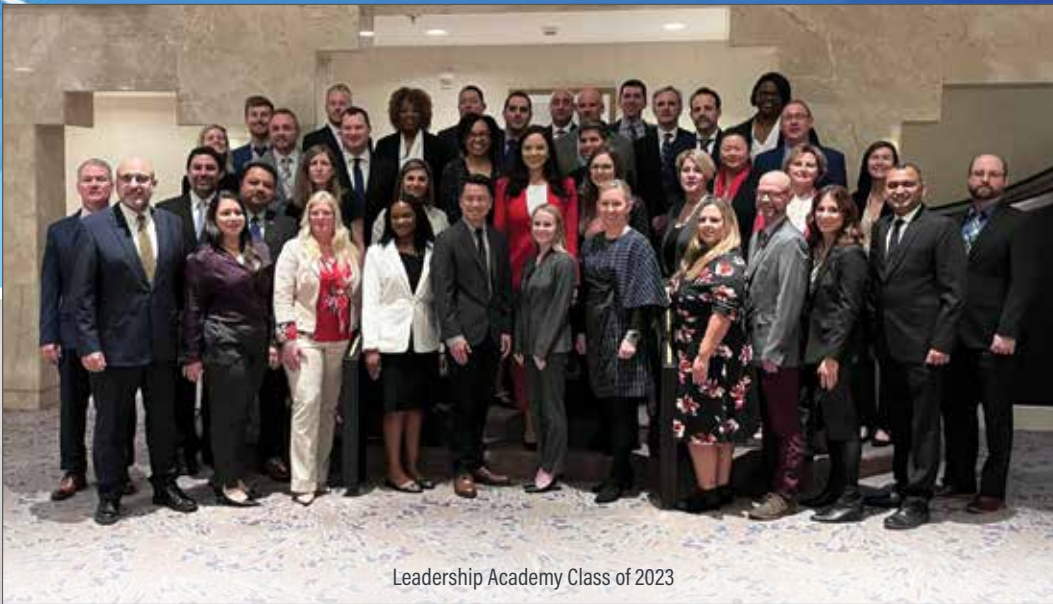
Leadership Academy Class of 2023