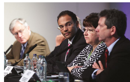
Left: A panel discussion which debated the Economic Policy & Technology Issues Affecting Mobility in the Future Above: Discussing the issues