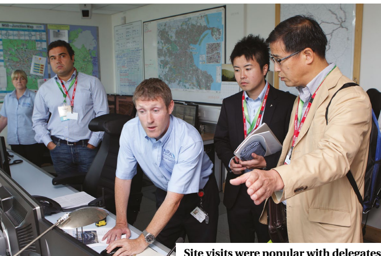
Site visits were popular with delegates