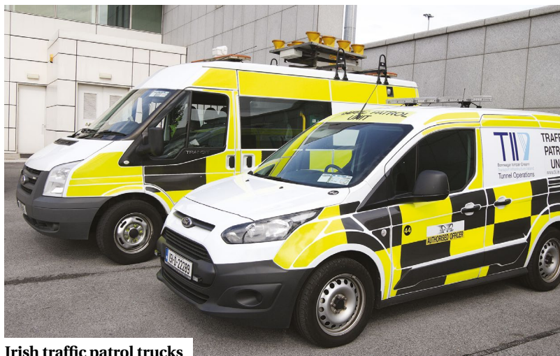
Irish traffic patrol trucks

Roughly 500 transportation leaders from 29 countries gathered for the International Bridge, Tunnel and Turnpike Association's (IBTTA) 83rd Annual Meeting and Exhibition in Dublin, Ireland in September (August 30-September 2).